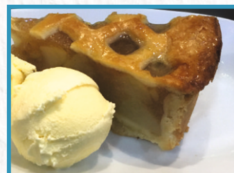
Lattice Apple Pie Served with vanilla ice cream or custard