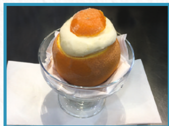
Orange or Lemon Sorbet