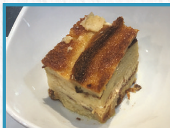
Bread and Butter Pudding Served with vanilla ice cream or custard