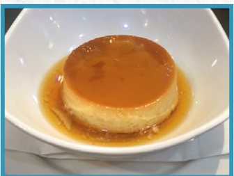
Homemade Creme Caramel