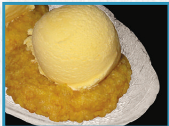
Homemade Pineapple Fritters Served with vanilla ice cream