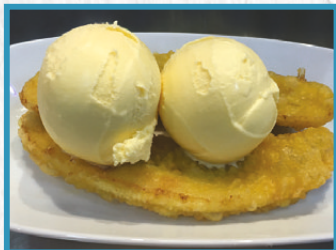
Homemade Banana Fritters Served with vanilla ice cream