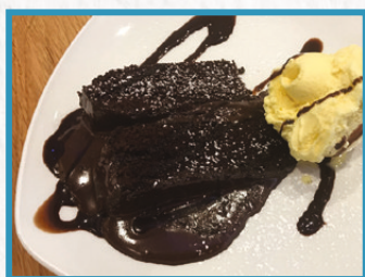
Chocolate Fudge Cake Two layers of soft chocolate sponge covered in a rich chocolate fudge fondant