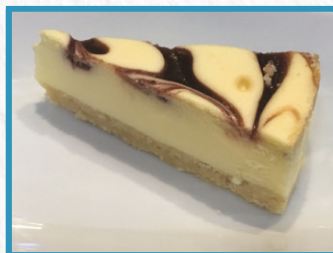
Strawberry Swirl Cheesecake