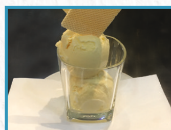
Vanilla Ice Cream Served with a choice of s Chocolate, Strawberry or Caramel 1 scoop £1.20 - 2 scoops £2.20 - 3 scoops £2.95